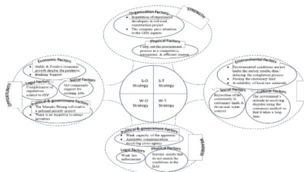
Fig 3: Matrix SWOT

After identifying the factors that determine the success of the toll road PPP, then interviews with stakeholders regarding the strategy in meeting the factors that drive the success of the Manado-Bitung toll road PPP are conducted. The interview results will then be grouped into an analysis of the internal and the external environment. External environmental analysis is an analysis of external factors or situations and conditions that are outside the organization, which in this case is the government and business entities, which can affect directly or indirectly the organizational performance of the government and business entities. The purpose of the external analysis is to develop a list of opportunities (opportunities) that can be exploited by the organization and a list of threats that the organization should avoid. Internal environmental analysis is an analysis to formulate and evaluate the strengths and weaknesses of the organization.